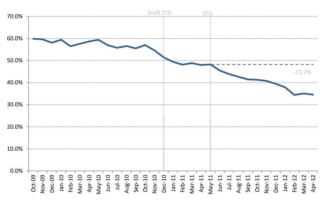
Figure 2: Percentage on net discount for voice in New Zealand

The on net discount for voice calls has declined 13.7 percentage points since the MTAS STD and 25.3 points since October 2009.