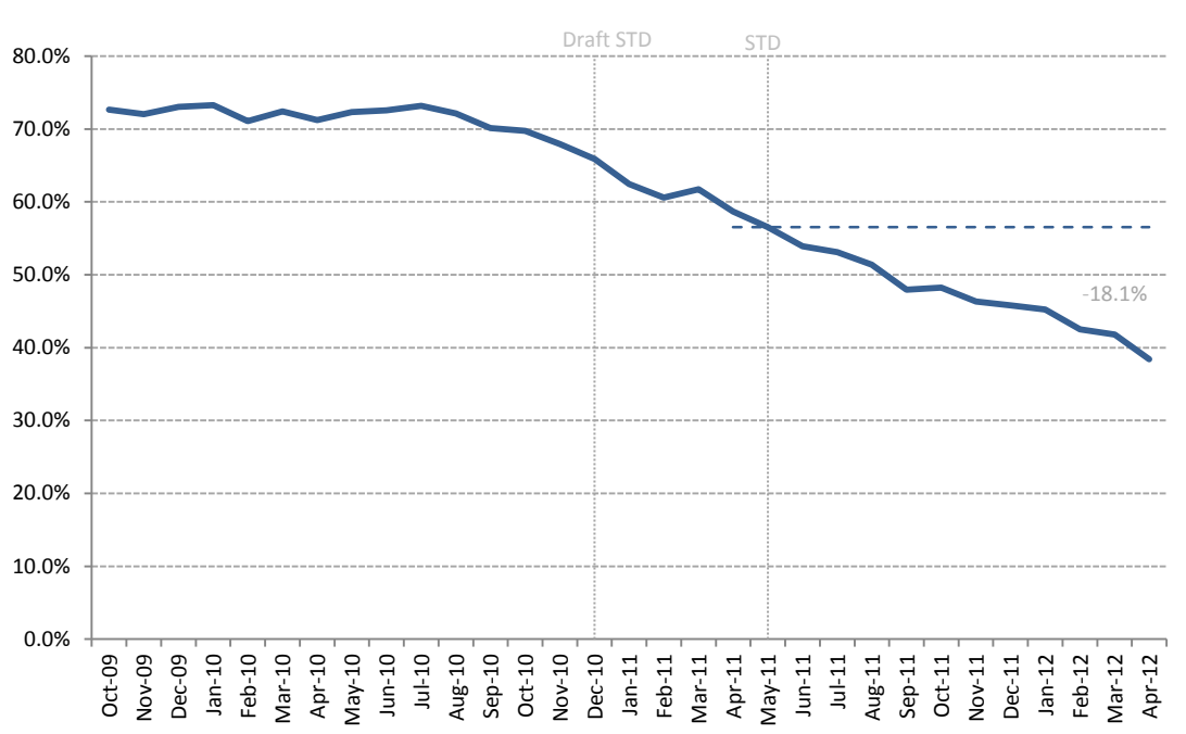
Figure 4: Percentage on-net discount for SMS in New Zealand

The on net discount for SMS has declined 18.1 percentage points since the MTAS STD and 34.2 points since October 2009.