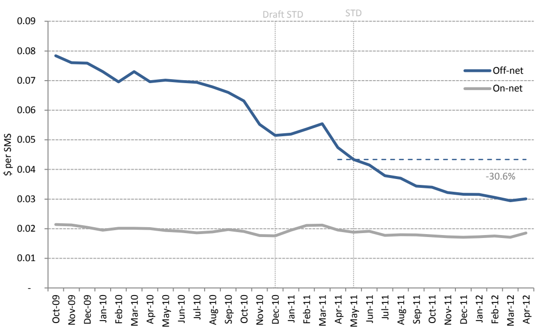
Figure 6: Industry average revenue per SMS in New Zealand

The average revenue per minute for off net SMS has declined 30.6% since the inception of the MTAS STD^2 , with a 61.6% drop since October 2009.