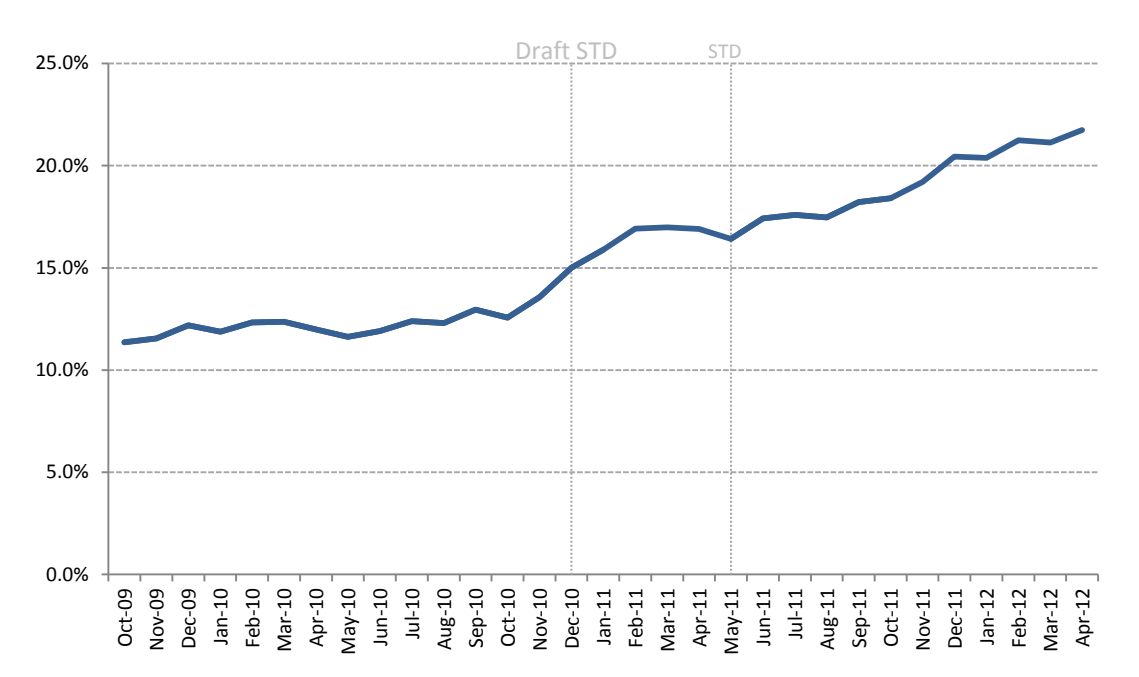
Figure 1: Percentage cross network voice traffic in New Zealand

Since May 2011 cross net voice traffic has increased 5.4 percentage points from 16.4% to 21.8% and by 10.4 percentage points since October 2009.